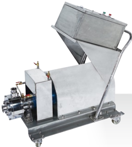
▲ 臥式移動型 Horizontal Movable Type