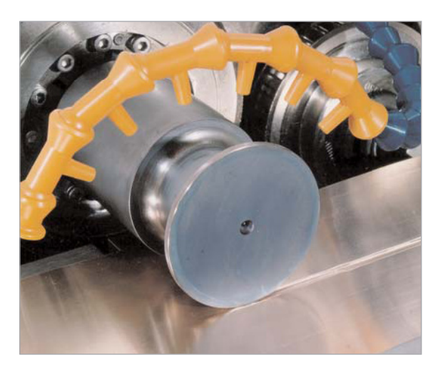
This close-up emphasizes the cleanliness, uniformity, and consistency of the ultrasonic weld.